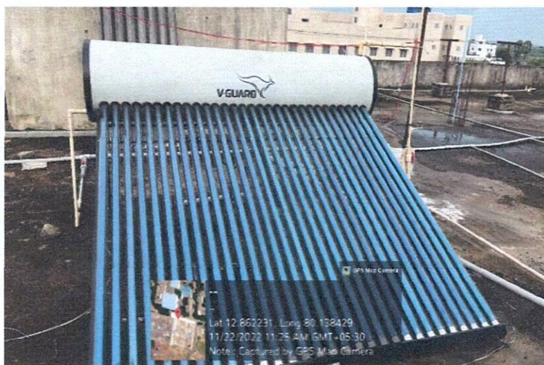
Solar Panels for energy conservation