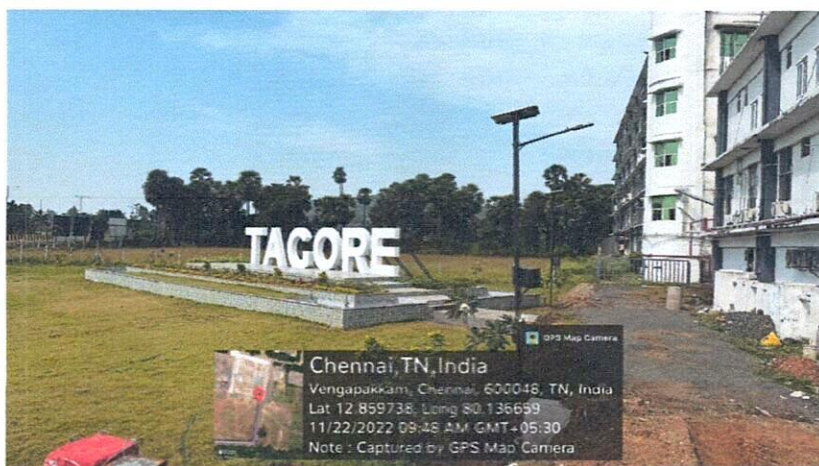
LED Lighting using Solar panel

(Affiliated to the Tamil Nadu Dr.MGR Medical University & Recognized by the Ministry of Health & Family welfare. Govt. of India New Delhi)