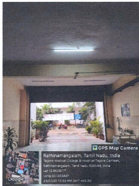
Sensor based lighting for power conservation

DEAN TAGORE MEDICAL COLLEGE & HOSPITAL RATHINAMANGALAM, MELAKOTTAIYUR POST, Chennai-600 127.