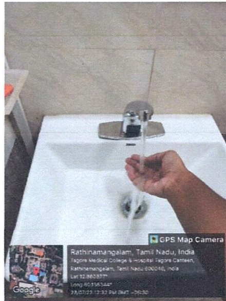
Sensor based tap at girls common room for energy conservation

(Affiliated to the Tamil Nadu Dr.MGR Medical University & Recognized by the Ministry of Health & Family welfare. Govt. of India New Delhi)