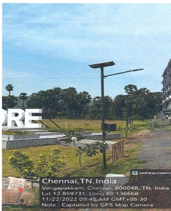
Lighting using Solar panels

[Signature] DEAN TAGORE MEDICAL COLLEGE & HOSPITAL RATHINAMANGALAM, MELAKOTTAIYUR POST, Chennai-600 127.